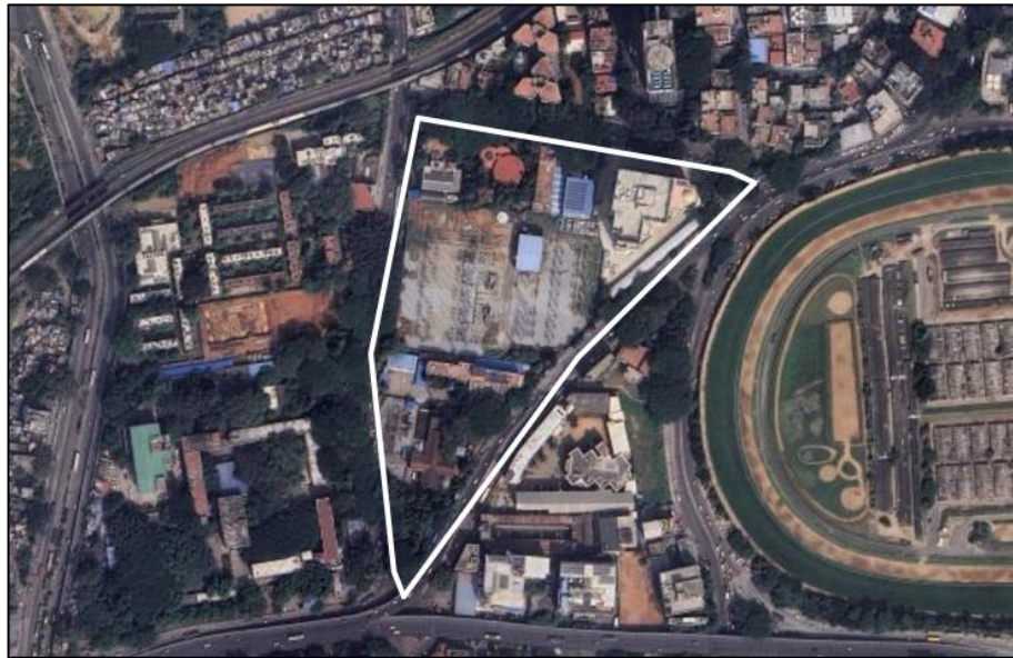
Figure 1: Satellite view of AR Circle Substation

Presently, the AR circle substation premises is spread across ~10 acres of land under KPTCL ownership. The site has existing built up area of ~464581 sqft. Site area available for construction of real estate is ~ 3.5 acres marked in black boundary in Figure 2.